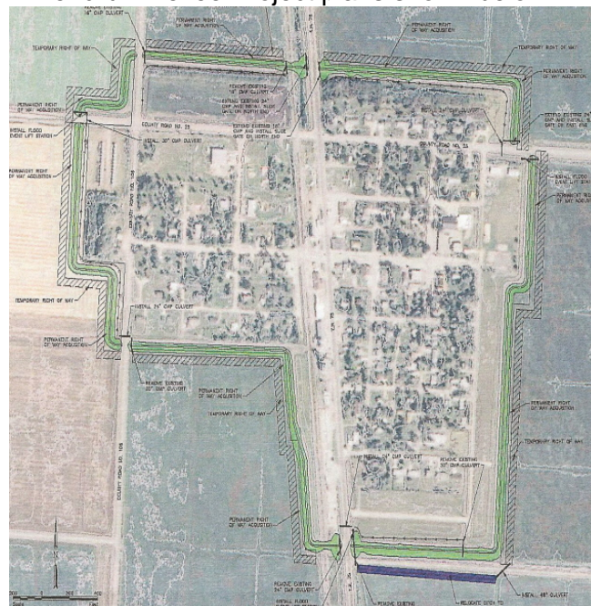
Hendrum Levee Project plans shown below: